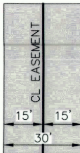
TYPICAL EASEMENT DETAIL NO SCALE