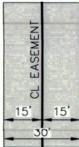
TYPICAL EASEMENT DETAIL NO SCALE